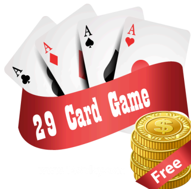
Figure (B): 29 Card Game by 143Play.com

It is true that there are several companies who are working in gaming sectors in Bangladesh. The top industries are http://www.143play.com/ , http://www.riseuplabs.com/ , http://www.ibtgames.com/ . The following figures (b,c) are some of the games which have been made in Bangladesh.