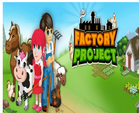
Figure (C): Factory Project by Risuplabs